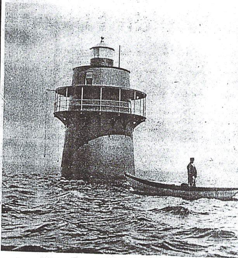
Bug Light — 1875

The 112-year-old Duxbury Pier Light, more commonly known as "The Bug Light" will be replaced sometime this summer by a new lighthouse by the U.S. Coast Guard.